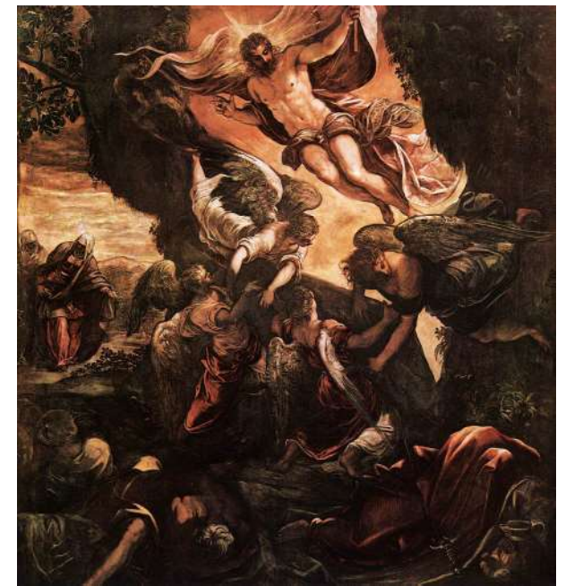
JACOPO TINTORETTO, PUBLIC DOMAIN, VIA WIKIMEDIA COMMONS