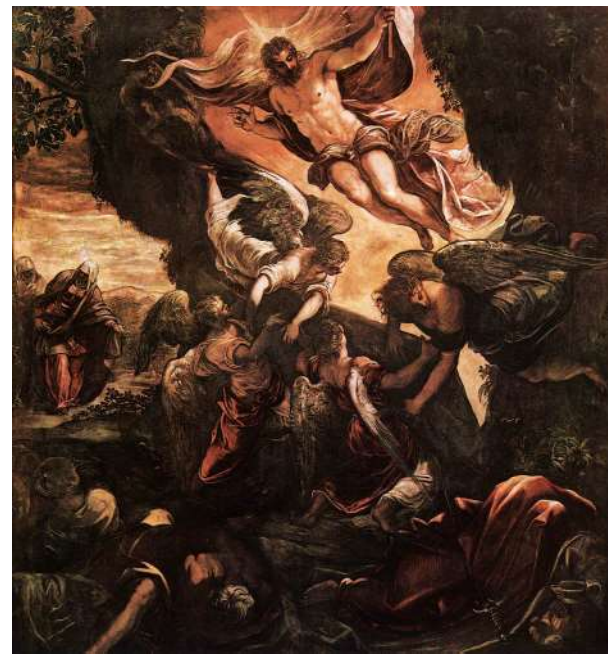
JACOPO TINTORETTO, PUBLIC DOMAIN, VIA WIKIMEDIA COMMONS