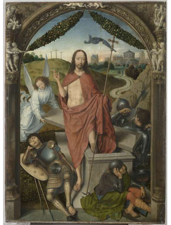
HANS MEMLING, PUBLIC DOMAIN, VIA WIKIMEDIA COMMONS