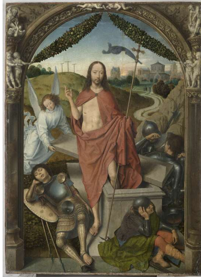
HANS MEMLING, PUBLIC DOMAIN, VIA WIKIMEDIA COMMONS